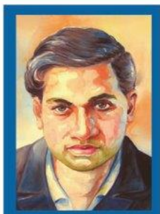
Srinivasa Ramanujan 1887 - 1920