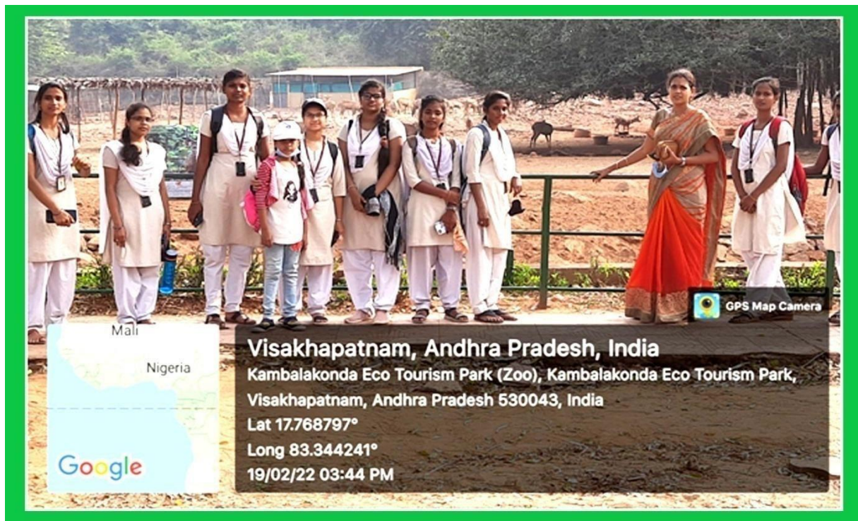
Students at the enclosure of Sambar deer.

Students observed some endemic primates like Bonnet monkey, Rhesus monkey and exotic primates like Baboon, Lemur, etc. Students watched Wild boar, Spotted deer, Nilgai, Sambar deer, Elephant etc.