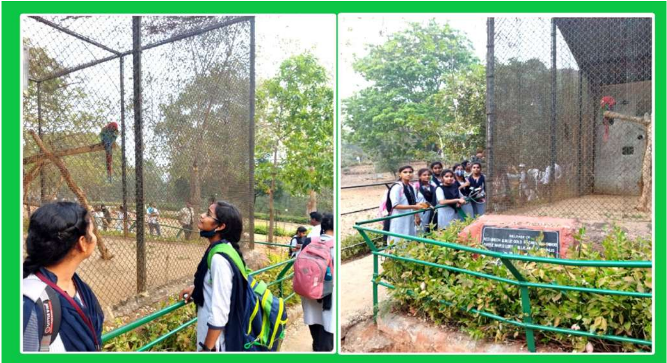
Students near the MACAW enclosure.

enclosure. Students got the chance to see its egg. They observed other birds like Emu, Macaw, Budgerigar, Love birds, Pea fowl etc.