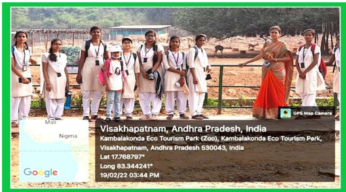
Students at the enclosure of Sambar deer

Students observed some endemic primates like Bonnet monkey, Rhesus monkey and exotic primates like Baboon, Lemur, etc. Students watched Wild boar, Spotted deer, Nilgai, Sambar deer, Elephant etc.