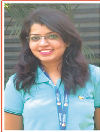
CSR Executive Unicharm India